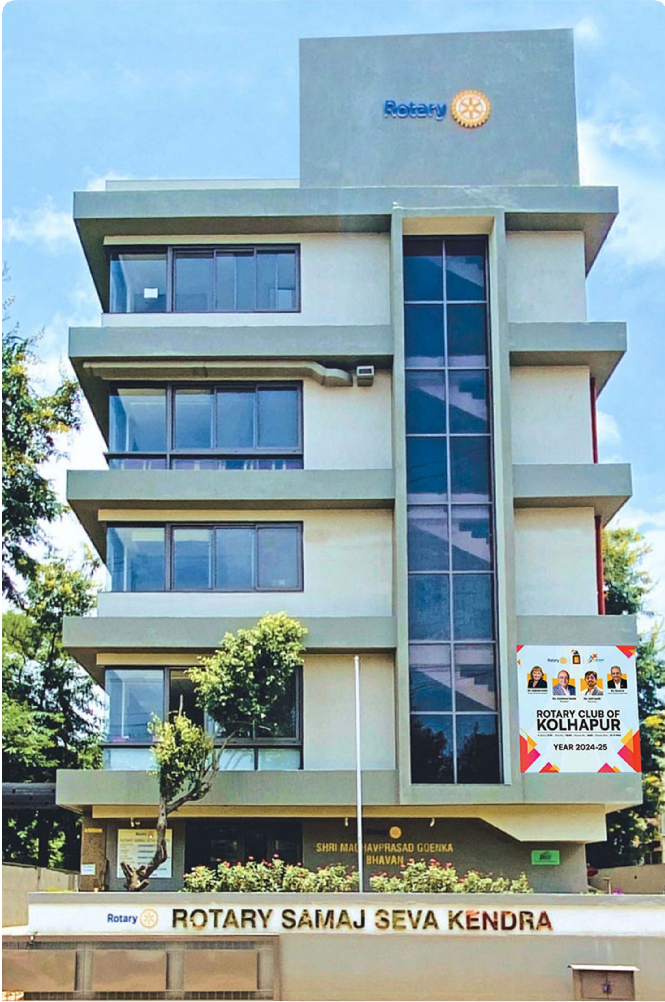
ROTARY CLUB OF KOLHAPUR'S ROTARY SAMAJ SEVA KENDRA BUILDING